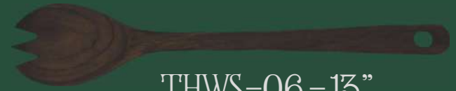
THWS-06 - 13"

OUR SALVAGED TEAK 13" COOKING UTENSILS AND NEW SET OF 7" CHARCUTERIE UTENSILS MAKE GREAT ADDITIONS TO OUR BOARDS AND BOWLS OR STANDALONE GIFTS. HAND CARVED VASES ARE MADE FROM 4 DIFFERENT WOODS COMING AS A SET OR INDIVIDUALLY. OUR COASTERS AND TEAK VALET TRAYS MAKE GREAT GIFTS AND CAN COME BLANK FOR YOUR ARTWORK OR WE CAN DECORATE THEM FOR YOU. ALL OF OUR ITEMS CAN BE ENGRAVED WITH YOUR PERSONALIZATION, ARTWORK OR LOGOS.