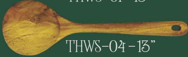
THWS-04 - 13"