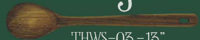
THWS-03 - 13"