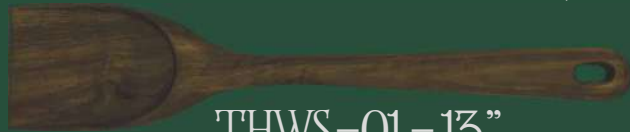
THWS-01 - 13"