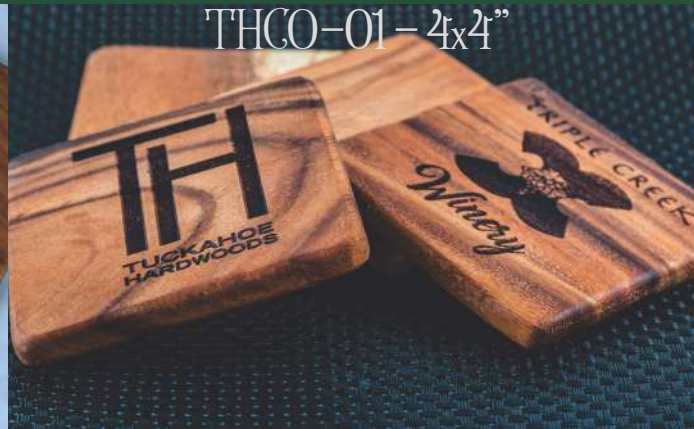
THCO-01 - 4x4"