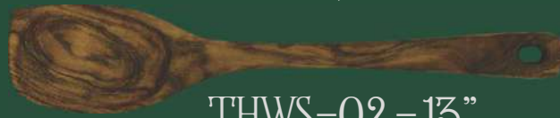
THWS-02 - 13"