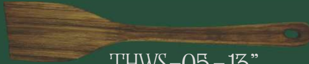
THWS-05 - 13"